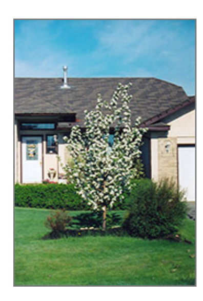
Fall Red Apple in bloom