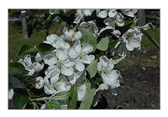
Fall Red Apple flowers

This tree is typically grown in a designated area of the yard because of its mature size and spread. It should only be grown in full sunlight. It prefers to grow in average to moist conditions, and shouldn't be allowed to dry out. It may require supplemental watering during periods of drought or extended heat. It is not particular as to soil type or pH. It is highly tolerant of urban pollution and will even thrive in inner city environments. This particular variety is an interspecific hybrid.