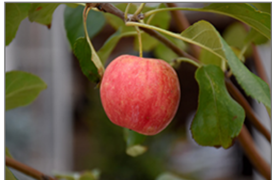
Rescue Apple-Crab fruit

Rescue Apple-Crab features showy clusters of lightly-scented white flowers with shell pink overtones along the branches in mid spring, which emerge from distinctive pink flower buds. It has forest green deciduous foliage. The pointy leaves turn yellow in fall. The fruits are showy red apples with hints of yellow, which are carried in abundance from mid summer to early fall. The fruit can be messy if allowed to drop on the lawn or walkways, and may require occasional clean-up.