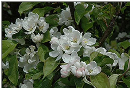
Rescue Apple-Crab flowers

This tree is typically grown in a designated area of the yard because of its mature size and spread. It should only be grown in full sunlight. It prefers to grow in average to moist conditions, and shouldn't be allowed to dry out. It may require supplemental watering during periods of drought or extended heat. It is not particular as to soil type or pH. It is highly tolerant of urban pollution and will even thrive in inner city environments. This particular variety is an interspecific hybrid.