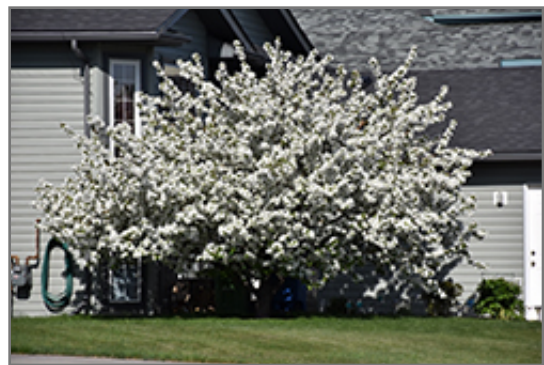
Rescue Apple-Crab in bloom