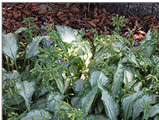
Silver Streamers Lungwort foliage

Other Names: Lords And Ladies, Bethlehem Sage