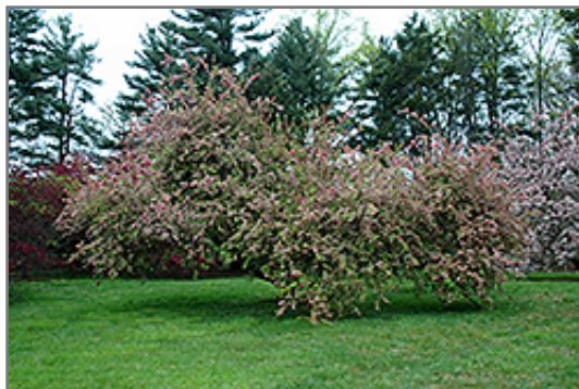
Bob White Flowering Crab in bloom