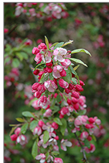
Bob White Flowering Crab flowers