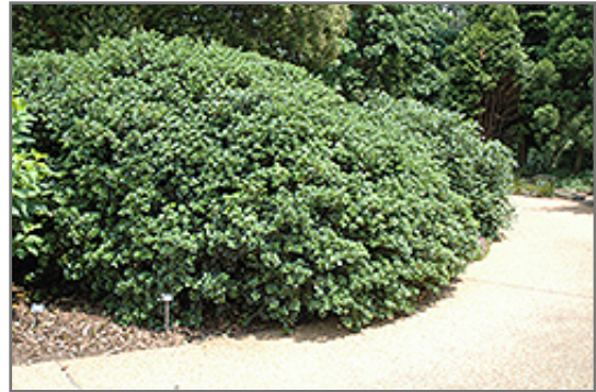
Roundleaf False Holly

Roundleaf False Holly is recommended for the following landscape applications;