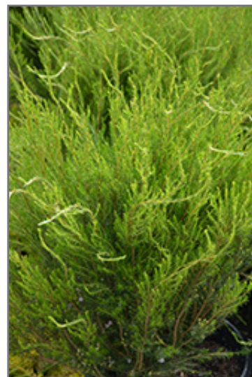
Confetti Bush foliage