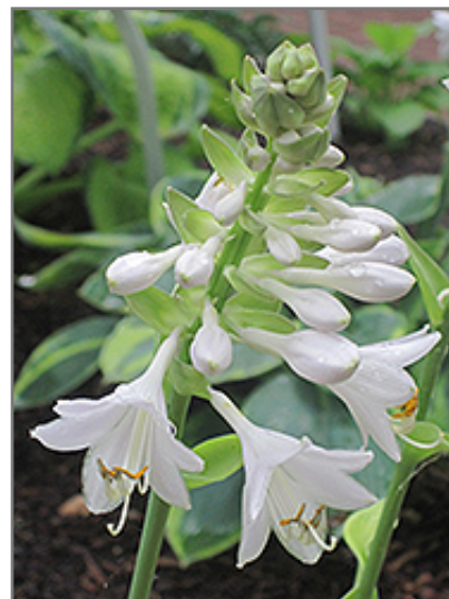
King Tut Hosta flowers