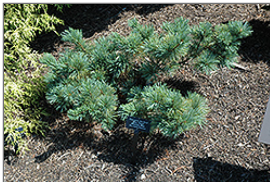
Blue Dwarf Japanese Stone Pine

Blue Dwarf Japanese Stone Pine is recommended for the following landscape applications;