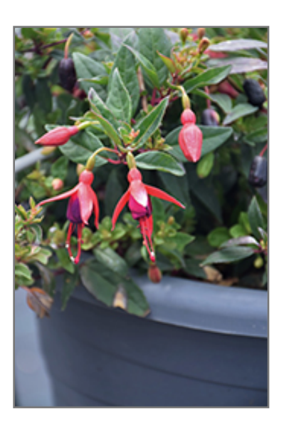
Angel Earrings Dainty Fuchsia flowers

Angel Earrings Dainty Fuchsia is recommended for the following landscape applications;