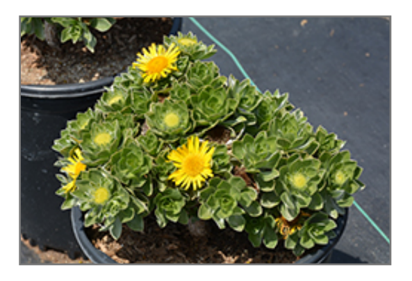
Canary Island Daisy in bloom