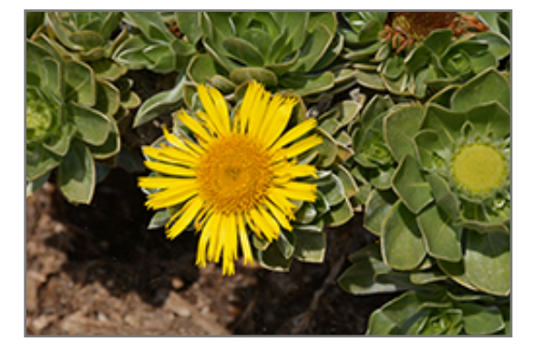
Canary Island Daisy flowers

Canary Island Daisy is recommended for the following landscape applications;