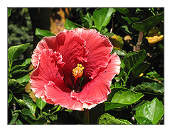
Gypsy Music Hibiscus flowers

When grown indoors, Gypsy Music Hibiscus can be expected to grow to be about 5 feet tall at maturity, with a spread of 3 feet. It grows at a fast rate, and under ideal conditions can be expected to live for approximately 5 years. This houseplant will do well in a location that gets either direct or indirect sunlight, although it will usually require a more brightly-lit environment than what artificial indoor lighting alone can provide. It requires an evenly moist well-drained soil for optimal growth, but will suffer if left to grow in standing water. The surface of the soil shouldn't be allowed to dry out completely, and so you should expect to water this plant once and possibly even twice each week. Be aware that your particular watering schedule may vary depending on its location in the room, the pot size, plant size and other conditions; if in doubt, ask one of our experts in the store for advice. It will benefit from a regular feeding with a general-purpose fertilizer with every second or third watering. It is not particular as to soil pH, but grows best in rich soil. Contact the store for specific recommendations on pre-mixed potting soil for this plant.