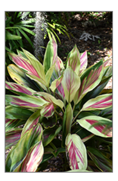
Exotica Hawaiian Ti Plant

When grown indoors, Exotica Hawaiian Ti Plant can be expected to grow to be about 4 feet tall at maturity, with a spread of 24 inches. It grows at a medium rate, and under ideal conditions can be expected to live for approximately 10 years. This houseplant will do well in a location that gets either direct or indirect sunlight, although it will usually require a more brightly-lit environment than what artificial indoor lighting alone can provide. It does best in average to evenly moist soil, but will not tolerate standing water. The surface of the soil shouldn't be allowed to dry out completely, and so you should expect to water this plant once and possibly even twice each week. Be aware that your particular watering schedule may vary depending on its location in the room, the pot size, plant size and other conditions; if in doubt, ask one of our experts in the store for advice. It will benefit from a regular feeding with a general-purpose fertilizer with every second or third watering. It is not particular as to soil type or pH; an average potting soil should work just fine.