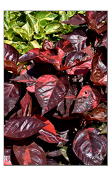
Louisiana Red Copper Plant foliage

When grown indoors, Louisiana Red Copper Plant can be expected to grow to be about 3 feet tall at maturity, with a spread of 3 feet. It grows at a fast rate, and under ideal conditions can be expected to live for approximately 30 years. This houseplant will do well in a location that gets either direct or indirect sunlight, although it will usually require a more brightly-lit environment than what artificial indoor lighting alone can provide. It prefers to grow in average to moist soil. The surface of the soil shouldn't be allowed to dry out completely, and so you should expect to water this plant once and possibly even twice each week. Be aware that your particular watering schedule may vary depending on its location in the room, the pot size, plant size and other conditions; if in doubt, ask one of our experts in the store for advice. It will benefit from a regular feeding with a general-purpose fertilizer with every second or third watering. It is not particular as to soil pH, but grows best in rich soil. Contact the store for specific recommendations on pre-mixed potting soil for this plant. Be warned that parts of this plant are known to be toxic to humans and animals, so special care should be exercised if growing it around children and pets.