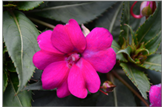
Solarscape Neon Purple Impatiens flowers

Solarscape Neon Purple Impatiens is recommended for the following landscape applications;