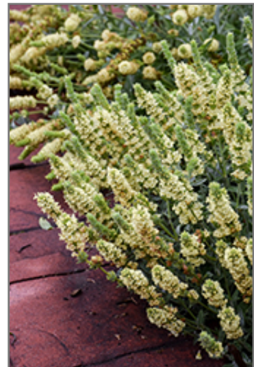
Ironwort flowers