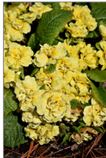
BELARINA Buttercup Primrose flowers