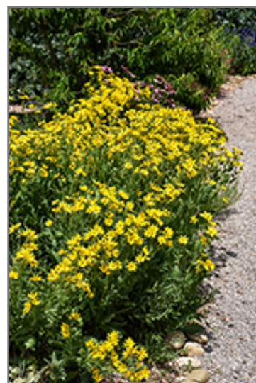
Engelmann's Daisy in bloom