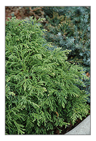
Snow Falsecypress foliage