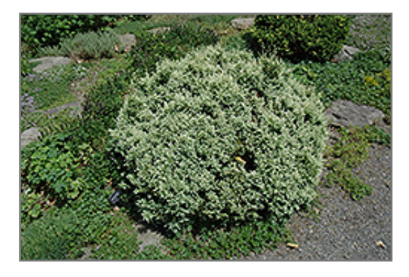
Snow Falsecypress

Snow Falsecypress is recommended for the following landscape applications;