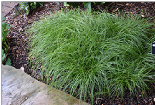
Remote Sedge