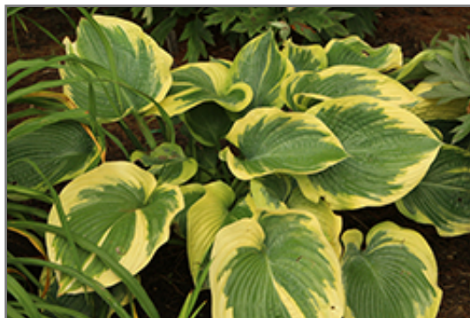
Terms Of Endearment Hosta foliage