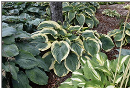
Terms Of Endearment Hosta

Terms Of Endearment Hosta is recommended for the following landscape applications;