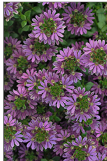
Surdiva Purple Fan Flower flowers

Surdiva Purple Fan Flower is recommended for the following landscape applications;