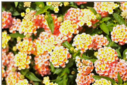
Lucky Peach Lantana flowers

Lucky Peach Lantana is recommended for the following landscape applications;