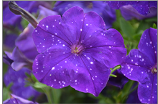
Constellation Virgo Petunia flowers

Constellation Virgo Petunia is recommended for the following landscape applications;