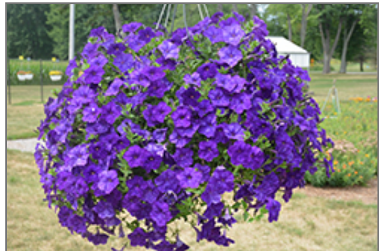
Constellation Virgo Petunia in bloom