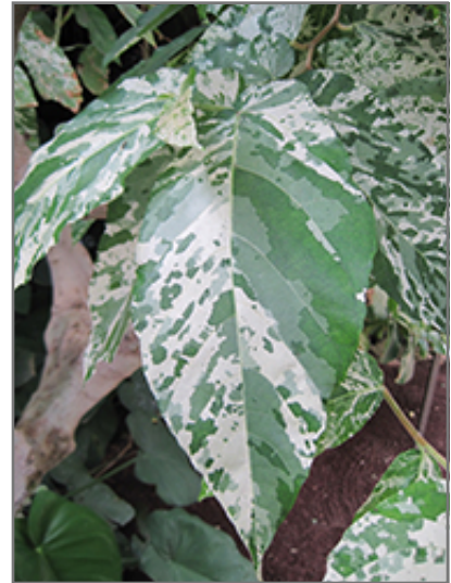
Florida Strangler Fig foliage

This is a multi-stemmed evergreen houseplant with an upright spreading habit of growth. This plant may benefit from an occasional pruning to look its best.