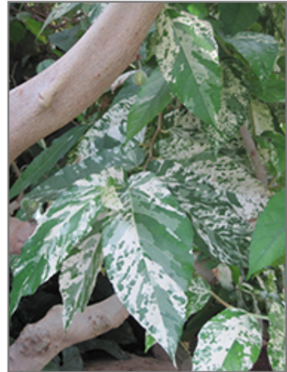
Florida Strangler Fig foliage

-- THIS IS A HOUSEPLANT AND IS NOT MEANT TO SURVIVE THE WINTER OUTDOORS IN OUR CLIMATE --