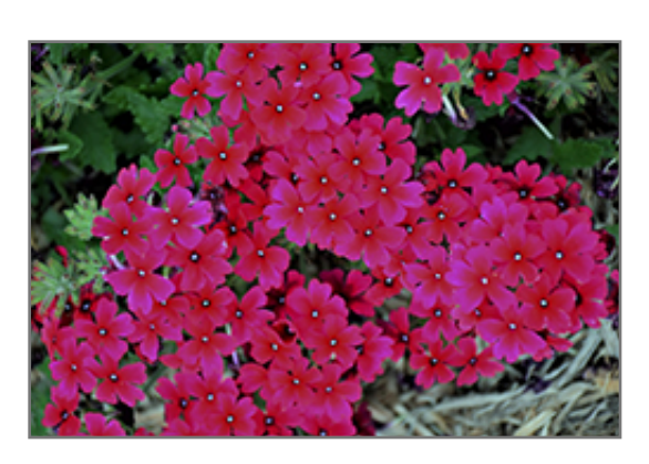
Lanai Magenta Verbena flowers