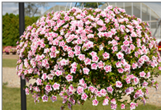
MiniFamous Uno Double PinkTastic Calibrachoa in bloom