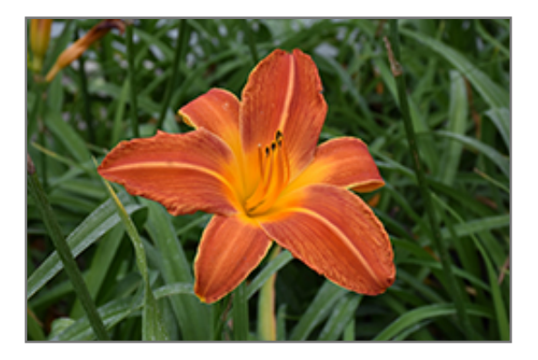
Orange Vols Daylily flowers