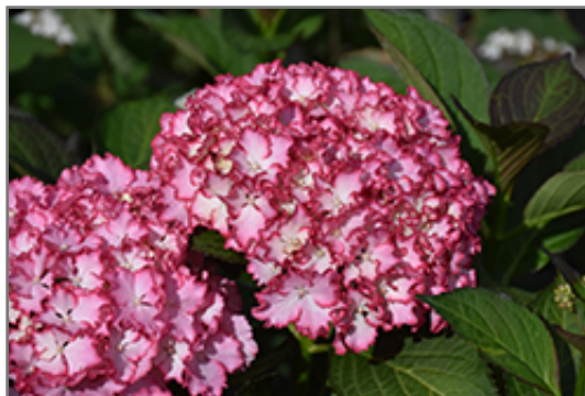
Seaside Serenade Fire Island Hydrangea flowers

This shrub will require occasional maintenance and upkeep, and should only be pruned after flowering to avoid removing any of the current season's flowers. It has no significant negative characteristics.