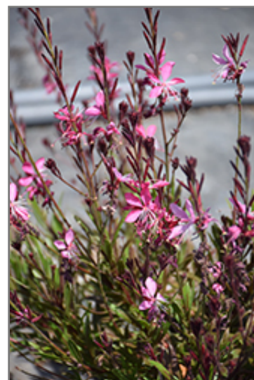
Whiskers Deep Rose Gaura flowers