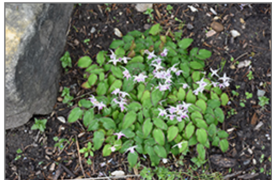
Starlet Barrenwort in bloom