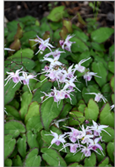
Starlet Barrenwort flowers