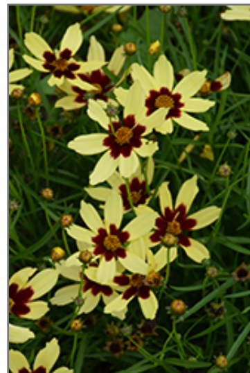
Electric Sunshine Tickseed flowers