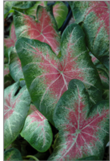
Rose Glow Caladium foliage

This stunning variety offers speckles, splashes, and spectacular contrast; fancy, rose pink leaves framed by dark green edges; a wonderful shade landscape accent; a great container plant, indoors or out