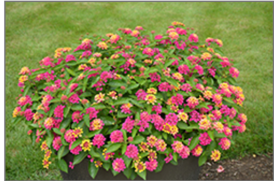
Luscious Royale Cosmo Lantana in bloom

Luscious Royale Cosmo Lantana will grow to be about 18 inches tall at maturity, with a spread of 24 inches. When grown in masses or used as a bedding plant, individual plants should be spaced approximately 18 inches apart. It has a low canopy. It grows at a fast rate, and under ideal conditions can be expected to live for approximately 20 years.