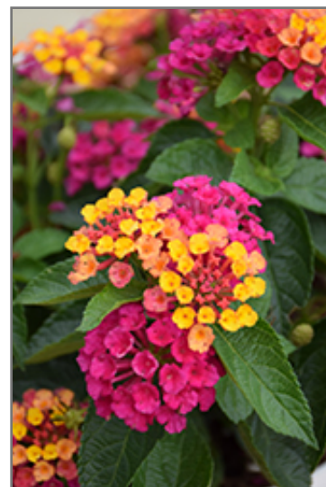
Luscious Royale Cosmo Lantana flowers

Luscious Royale Cosmo Lantana is recommended for the following landscape applications;