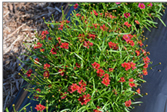
Twinklebells Red Tickseed in bloom