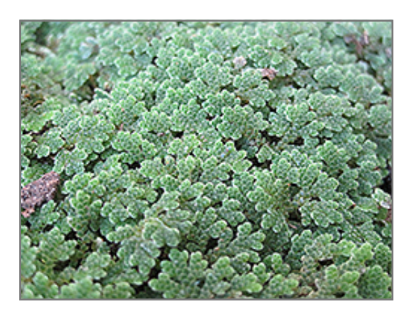
Mosquito Fern foliage

This is a relatively low maintenance plant, and may require the occasional pruning to look its best. It has no significant negative characteristics.