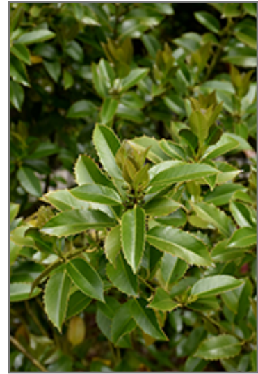
Chestnut Leaf Holly foliage

This tree does best in full sun to partial shade. It prefers to grow in moist to wet soil, and will even tolerate some standing water. It is particular about its soil conditions, with a strong preference for rich, acidic soils. It is quite intolerant of urban pollution, therefore inner city or urban streetside plantings are best avoided, and will benefit from being planted in a relatively sheltered location. Consider applying a thick mulch around the root zone in winter to protect it in exposed locations or colder microclimates. This particular variety is an interspecific hybrid.