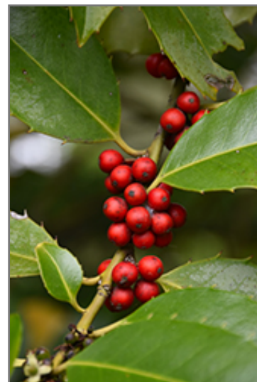
Chestnut Leaf Holly fruit