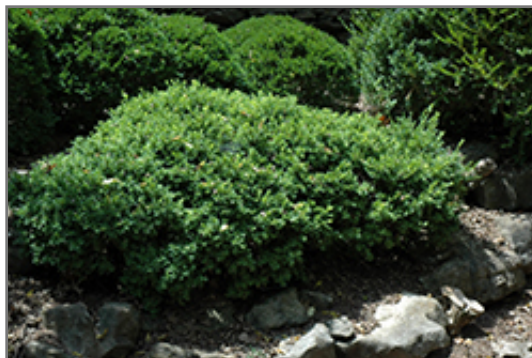
Grace Hendrick Phillips Boxwood

Grace Hendrick Phillips Boxwood is recommended for the following landscape applications;