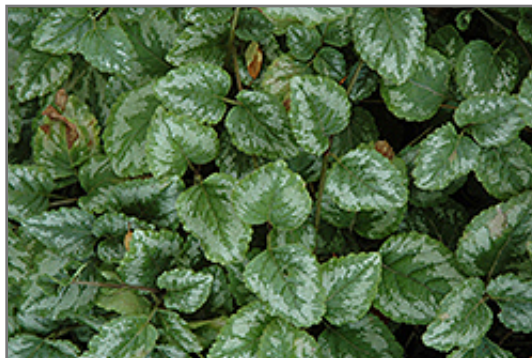
Jade Frost Archangel foliage