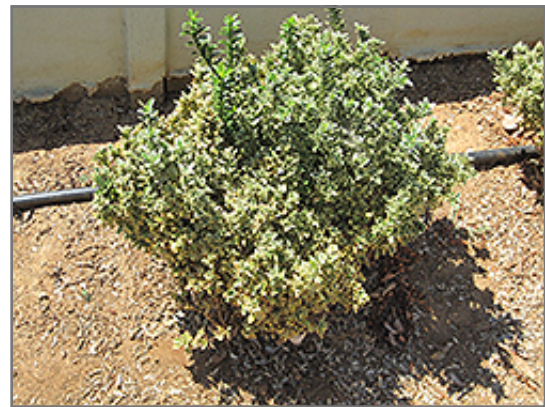
Variegated Boxleaf Japanese Euonymus