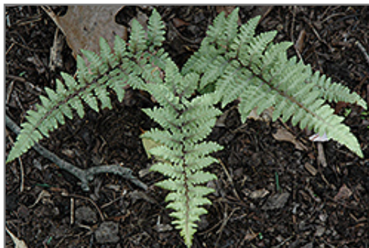
Silver Sentry Painted Fern foliage

A stunning giant variety producing luminous silver-green fronds; clump-forming and dense, perfect for shady spots; beautiful in masses on the edges of ponds or streams