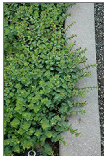
Lebanese Oregano

Lebanese Oregano is recommended for the following landscape applications;