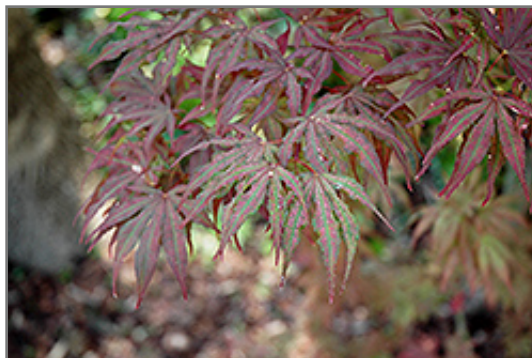
Mikazuki Japanese Maple foliage