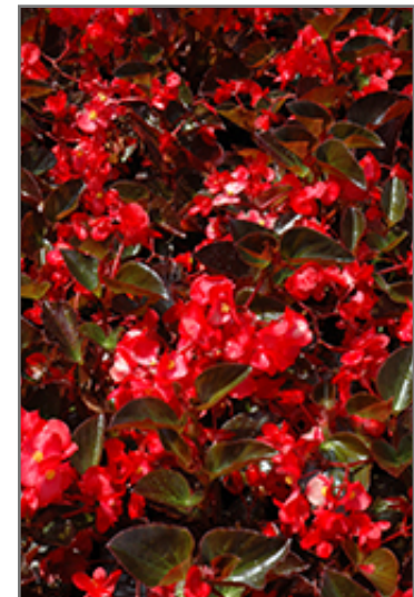
Big Red Bronze Leaf Begonia flowers