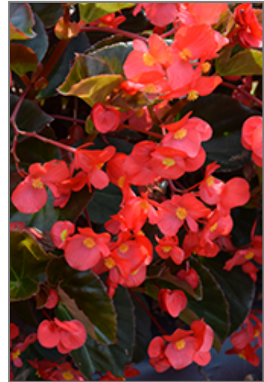
Big Red Bronze Leaf Begonia flowers

Big Red Bronze Leaf Begonia is a fine choice for the garden, but it is also a good selection for planting in outdoor containers and hanging baskets. It is often used as a 'filler' in the 'spiller-thriller-filler' container combination, providing a mass of flowers and foliage against which the larger thriller plants stand out. Note that when growing plants in outdoor containers and baskets, they may require more frequent waterings than they would in the yard or garden.