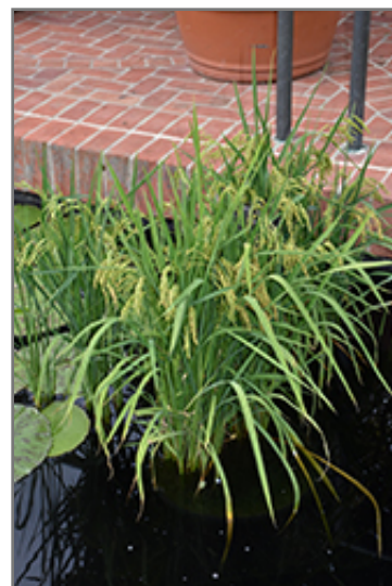
Asian Rice in bloom