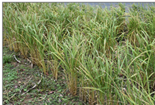
Asian Rice