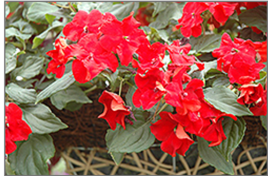
Spellbound Dark Red Impatiens flowers