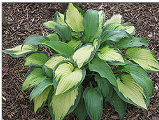
Wooly Mammoth Hosta