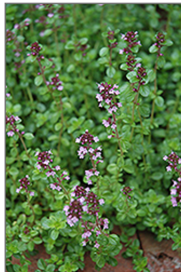
Broadleaf Thyme flowers

This is a dense herbaceous evergreen perennial herb with a spreading, ground-hugging habit of growth. It brings an extremely fine and delicate texture to the garden composition and should be used to full effect. This plant will require occasional maintenance and upkeep, and is best cleaned up in early spring before it resumes active growth for the season. Deer don't particularly care for this plant and will usually leave it alone in favor of tastier treats. Gardeners should be aware of the following characteristic(s) that may warrant special consideration;