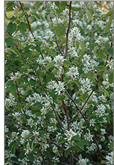
Pembina Saskatoon flowers