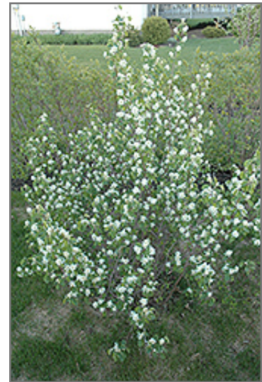
Pembina Saskatoon in bloom

Pembina Saskatoon is blanketed in stunning clusters of white flowers rising above the foliage from early to mid spring before the leaves. It has dark green deciduous foliage. The oval leaves turn an outstanding yellow in the fall. It features an abundance of magnificent blue berries in late spring.