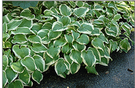
Shade Fanfare Hosta