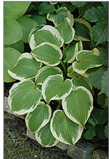
Shade Fanfare Hosta foliage

Shade Fanfare Hosta is recommended for the following landscape applications;