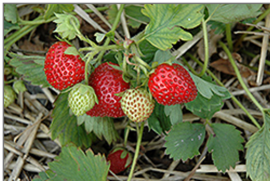
June-Bearing Strawberry fruit